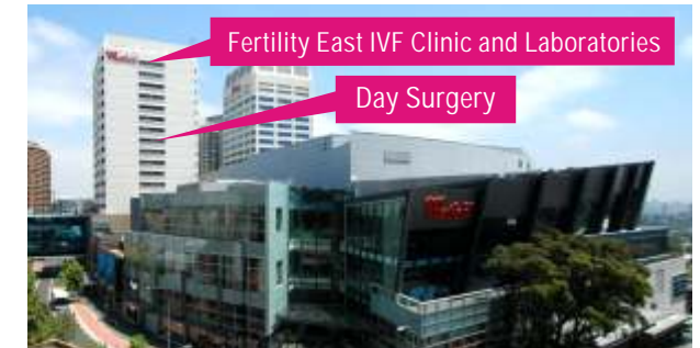
Level 26, Westfield Tower 1, 520 Oxford St, Bondi Junction

Fertility East is a completely purpose built fertility clinic. Its IVF laboratories and clinic on the 26th floor of Westfield Tower 1, are in the heart of Bondi Junction and accessible via the shopping centre. The day surgery, where patients have their egg retrieval procedures, is located in the same building on level 19. This enables couples to be treated for all fertility needs including ultrasounds, blood & semen analysis plus IVF and ICSI procedures in the one location. Ease of parking or public transport and the total anonymity of a shopping centre location are other benefits of undertaking your treatment at Fertility East.