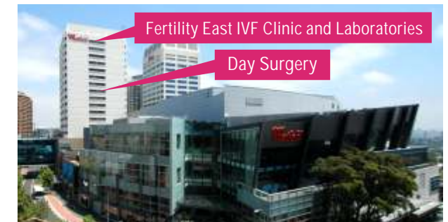
Level 26, Westfield Tower 1, 520 Oxford St, Bondi Junction

Fertility East is a completely purpose built fertility clinic. Its IVF laboratories and clinic on the 26th floor of Westfield Tower 1, are in the heart of Bondi Junction and accessible via the shopping centre. The day surgery, where patients have their egg retrieval procedures, is located in the same building on level 19. This enables couples to be treated for all fertility needs including ultrasounds, blood & semen analysis plus IVF and ICSI procedures in the one location. Ease of parking or public transport and the total anonymity of a shopping centre location are other benefits of undertaking your treatment at Fertility East.